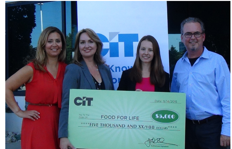
Thank you to everyone who voted for Food for Life in CIT's Foodortunity contest and to CIT for their gracious donation of $5,000 USD.